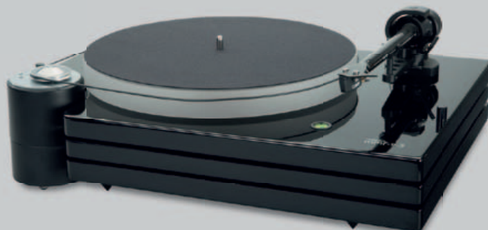
Plattenspieler mmf-9.3 Reichmann-AudioSysteme.de