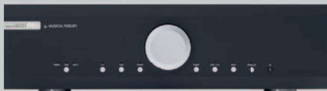
High End-Vollverstärker M6si Reichmann-AudioSysteme.de